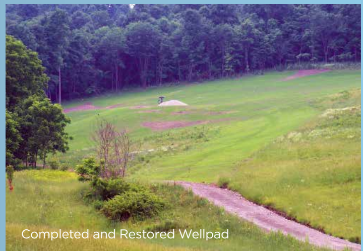
Completed and Restored Wellpad