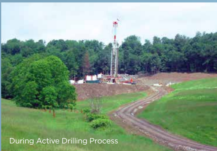
During Active Drilling Process

Drilling and completing wells at a typical Marcellus well pad takes place over the course of several months and involves the use of a drilling rig and different types of heavy equipment, with periods of inactivity as equipment is moved into place and assembled. Upon completion, equipment is removed and the wellpad is revegetated. The small remaining footprint on the wellpad commonly includes wellheads, water storage tanks, dehydrators and monitoring equipment.